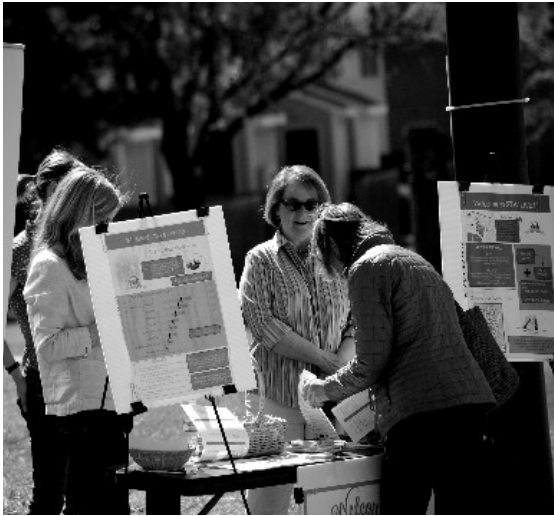
CA-MPO Engagement Plan Charlottesville Albemarle Metropolitan Planning Organization